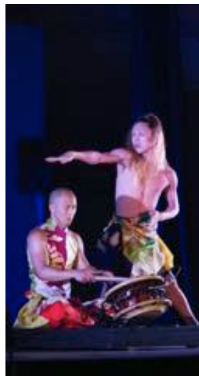
2013 Izumo Grand Shrine