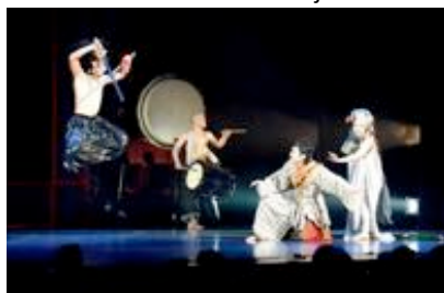
2014 Dramatic Kojiki